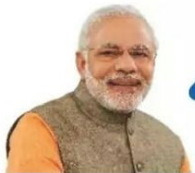
Narendra Modi Prime Minister